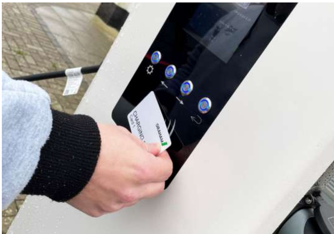
Figure – Electric Vehicle car charging at SIGH offices